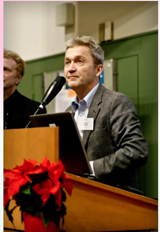
Gunnar Pejler from Sweden explains everything about mast cell proteases and proteoglycans