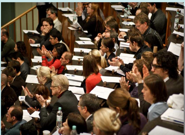
Over 300 masto- and basophiliacs participating at the meeting, organizers were obliged to change the venue